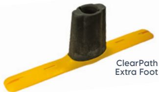
ClearPath Extra Foot